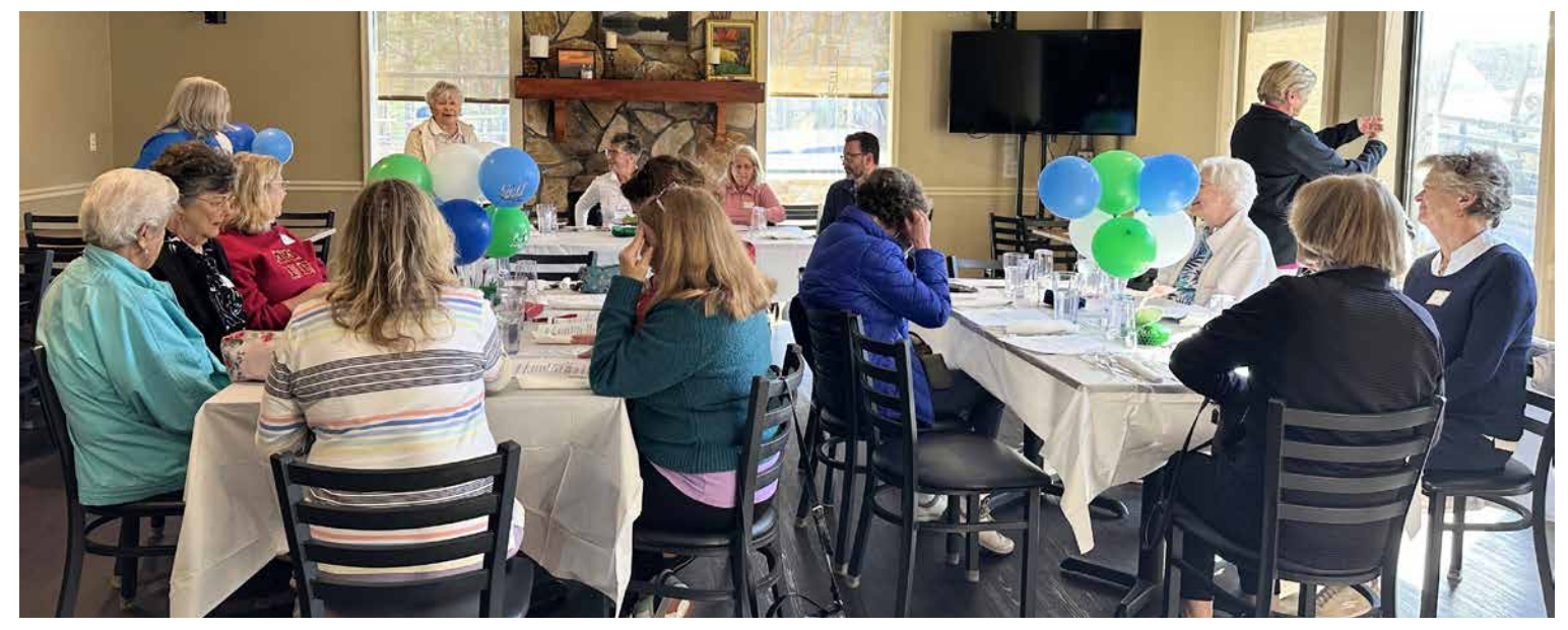
The Niners recently held their Opening Breakfast to kick off the 2025 season.

Let's make it unforgettable — see you on the course! 🏌 🖺 🔩