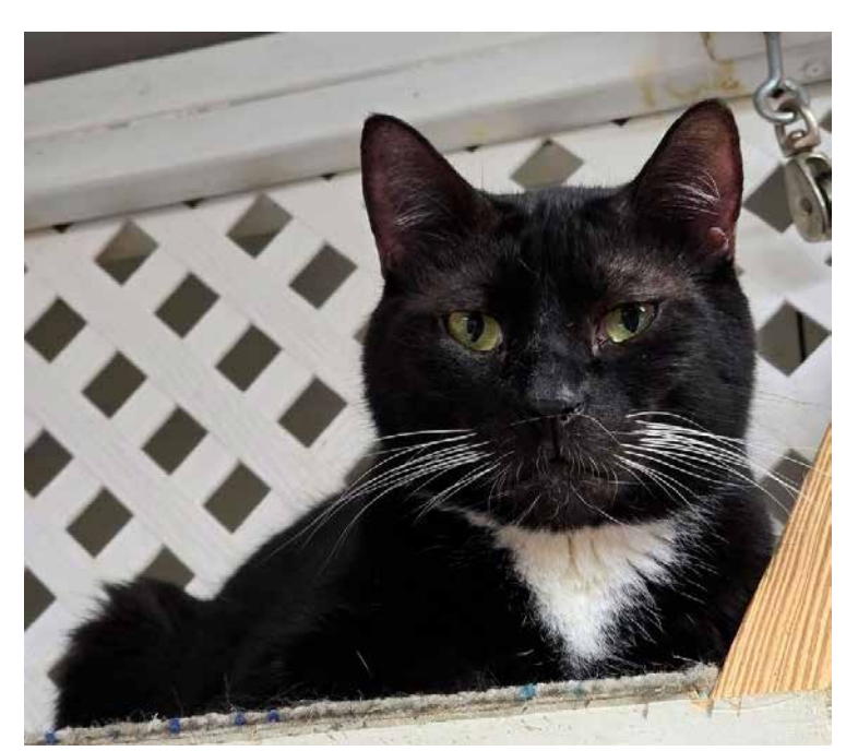
This is Freedom...