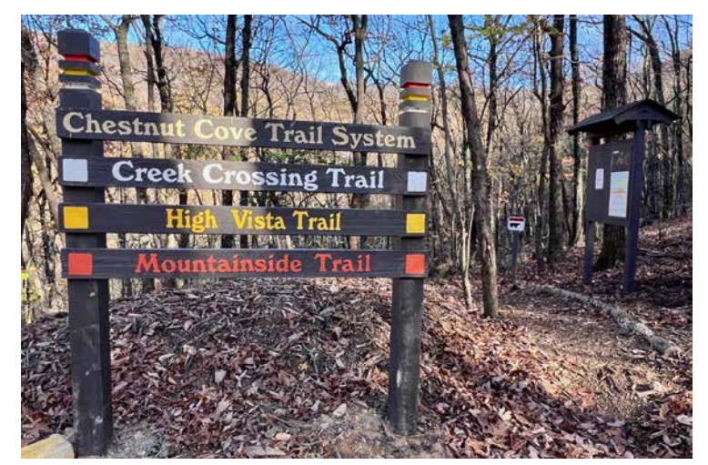
The Chestnut Cove Trail System