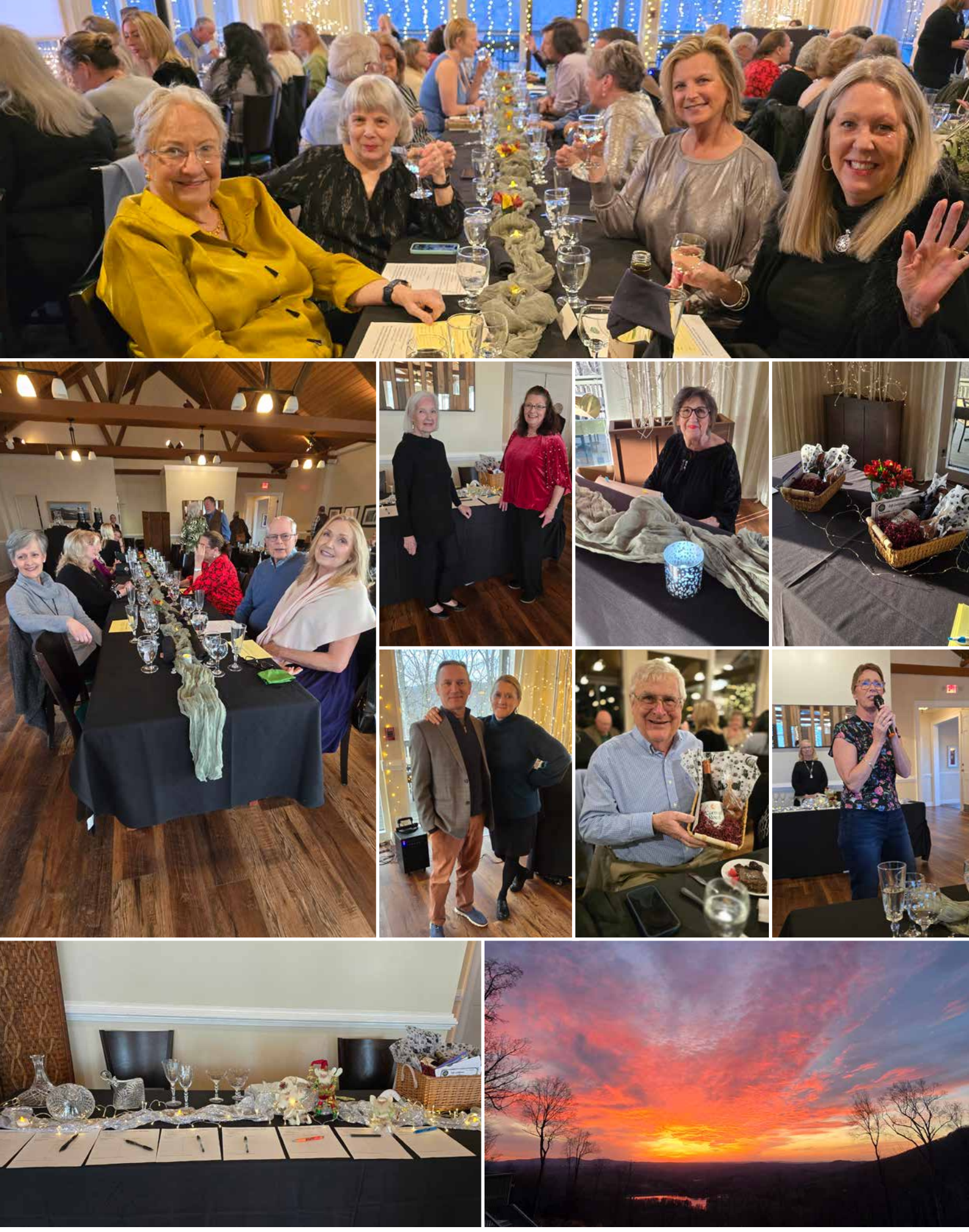
Bent Tree // bent-tree.com