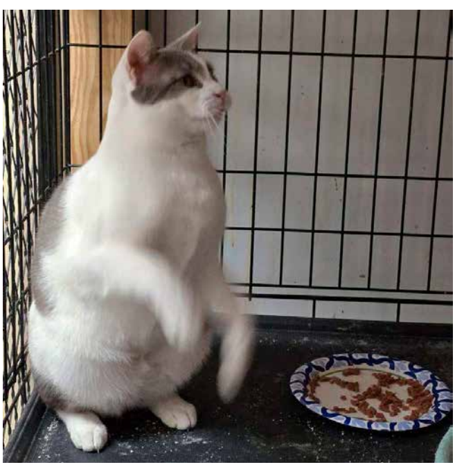
And last but certainly not least, Jazzy Jersey!