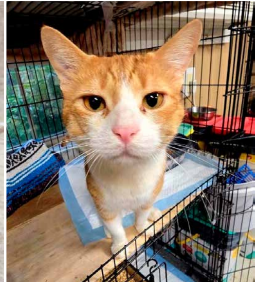
Say hello to Gatsby and Watson...